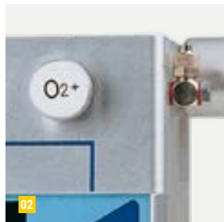
02 O 2 + FLUSH BUTTON DETAIL