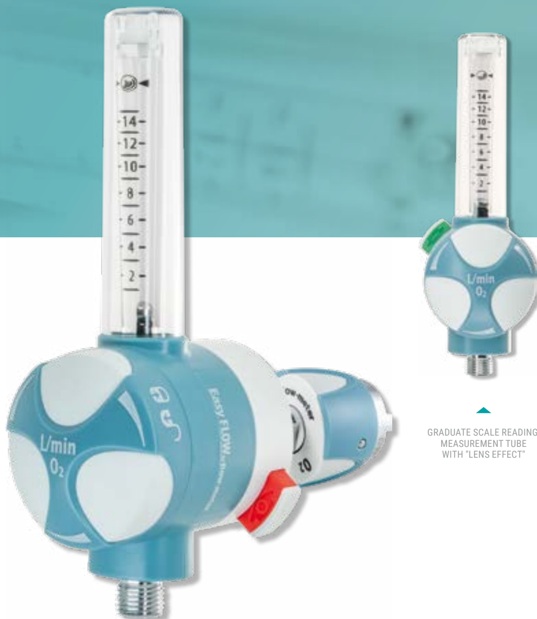
GRADUATE SCALE READING, MEASUREMENT TUBE WITH "LENS EFFECT"