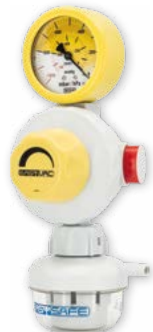
EASYVAC® VACUUM REGULATOR WITH EASYSAFE® SAFETY JAR (OPTIONAL)