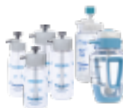
Humidifiers from p. 47