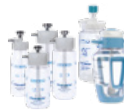
Humidifiers from p. 47