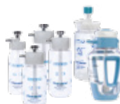
Humidifiers from p. 47