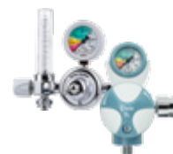
Pressure regulators from p. 37