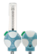
Variable area and orifices calibrated oxygen flowmeters from p. 19